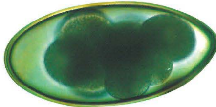
Nematodirus (threadneck worm)