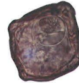
Moniezia (tapeworm - cattle)