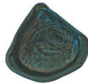
Moniezia (tapeworm - sheep)