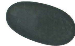
Mite Egg - 1/4 actual size (contaminant - often mistaken for worm eggs)

D.H Bliss and W.G. Kvasnicka; the compendium, April 1997