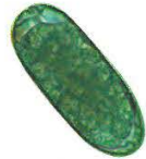
Cooperia (small intestinal worm)