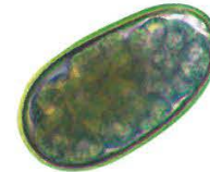
Oesophagostomum (nodular worm)