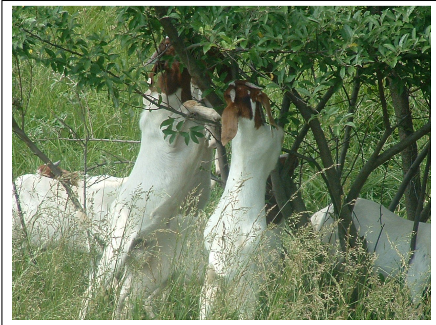
Figure 1. Goats browsing autumn olive shrub.